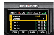
Night - High Contrast